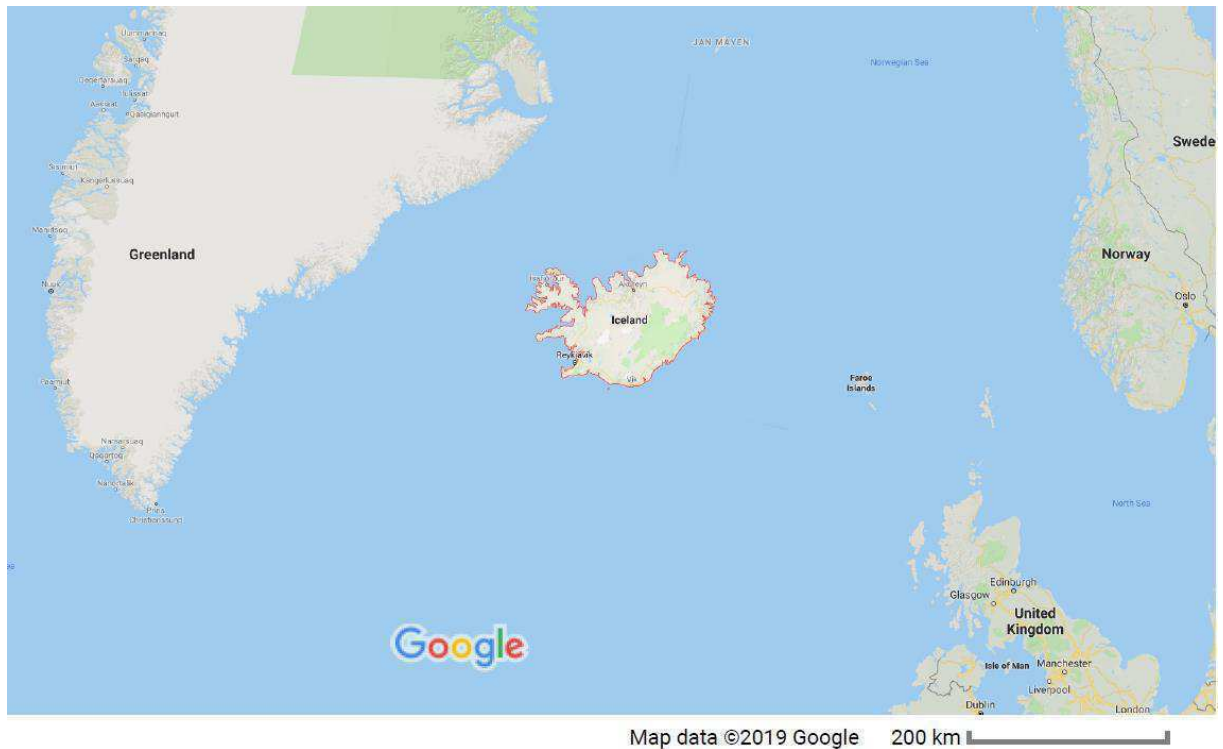
Picture 1 – Map of Iceland, Greenland, The United Kingdom and part of Northern Europe

(HENDERSON, 2004). In 2018 the government has allowed the hunting of 191 whales to balance the proportion of whales and fishes around its coast (BOFFEY, 2018).