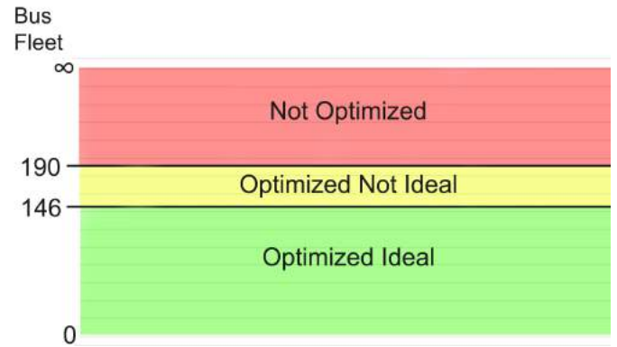
Fig. 4. Range of possible processing results estimated by the metaheuristic. Red - Not Optimized for results greater than 190; Yellow - Optimized Not Ideal for results under 190 and over 146; Green - Optimized Ideal for results under or equal to 146.

In the statistical analysis of the estimated optimization it is observed that ideally about 76% of buses should remain in the daily urban public transport service of Palmas. So we have three ranges of results that we can expect from metaheuristics, as observed in the image 4, for processing and result more than 190, the problem was not optimized, because it uses a greater amount of buses than the existing, for results between 190 and more than 146 the problem was optimized, but not ideally, because it would show savings, however, not expected, and for result between 146 or less we have the ideal optimization, which proposes the desired economy.