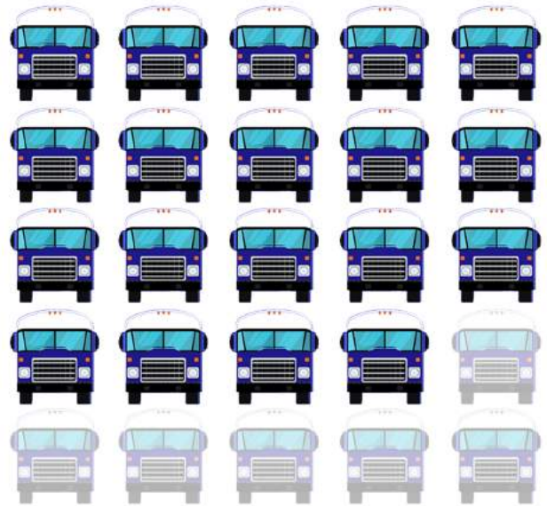
Fig. 2. Optimal bus use ratio. For every 25 vehicles used in the current proposal, the optimal optimization recommends using 19 buses.

So if consider R$ 1 631 511 spent on fuel being equal to 20% of the final costs, the variable costs that represent all the expenses of maintenance and operation of the vehicles, which involves fuel, lubricants and auto parts, are equal to R$ 2,610,418, so finally, with the final value of the variable costs, each vehicle spent around R$ 13,739 per month to make public transport trips in the city. So, to save on average R$ 600,000 applied in the optimization of the amount of buses used in public transport of Palmas, the expenses of variable costs can not exceed about R$ 2,010,000 and for this, the fleet of 190 buses should ideally reduce to 146 buses, that is, use only 76% of the fleet currently used, thus spending R$ 2,005,894 with variable costs.